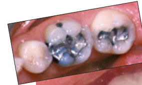
Replace Old Metal Fillings