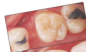
Replace a Posterior Tooth