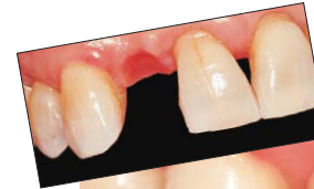
Replace an Anterior Tooth